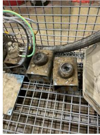
Received this way