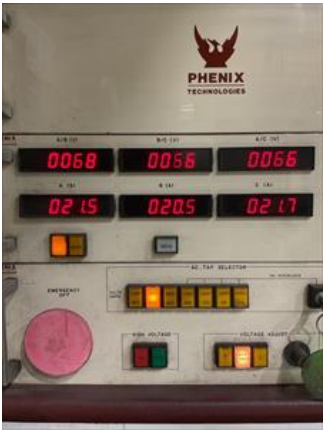
Delta co sign CRW