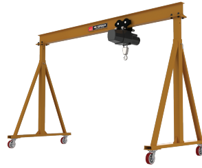
Model 512 Adjustable Height Portable Steel Gantry Crane Adjustable Height and Span Steel Construction Portability with standard casters Rated loads from 1/8 to 10 ton Span lengths up to 30+ feet