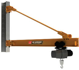
Model 311 Tie Rod Style Wall Mounted Jib Crane Economical Solution 180+ Rotation Capacities up to 12 Ton Spans up to 35+ Ft. Wall or Column Mounted Motorization Available