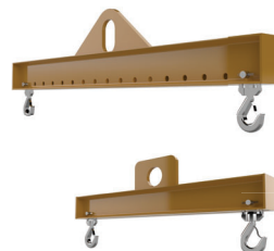
Model BTH Below the Hook Lifting Devices Low Headroom Applications Adjustable or Fixed Fully Customizable