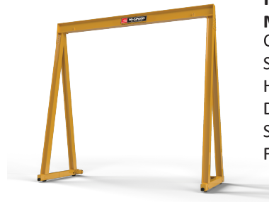
Model 514 Motorized Gantry Cranes Capacities up to 10+ Ton Span lengths up to 30+ Ft. Heights up to 30+ Ft. Double Leg or Single Leg Design Semi-Gantry Cranes Available Fully Customizable