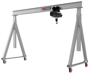
Model 582 Adjustable Height Aluminum Gantry Crane Aluminum Construction Fixed Height and Span Light Weight Rated loads from 1/8 to 2 ton Span lengths up to 20 feet