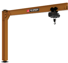
Model 314 Mast Type Cantilever Jib Crane No Foundation Required Capacities up to 10 Ton Spans up to 25+ Ft. Heights up to 25+ Ft. 360 Rotation