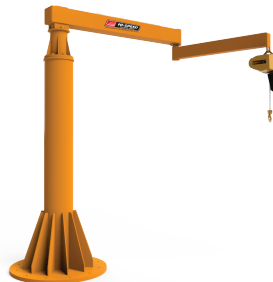
Model 350AJ Freestanding Articulating Jib Crane Full 360 Articulation Capacities up to 2 Ton Spans up to 16+ Ft. Heights up to 16+ Ft. Ergonomic Handling