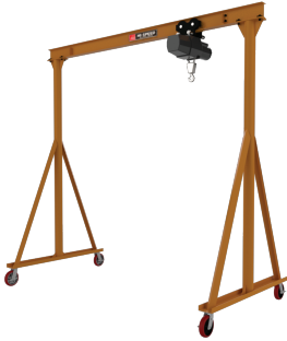
Model 511 Fixed Height Portable Steel Gantry Crane Fixed Height Steel Construction Portability with standard casters Rated loads from 1/8 to 10 ton Span lengths up to 30+ feet