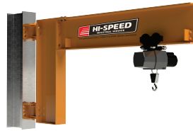
Model 313 Cantilever Style Wall Mounted Jib Crane Low Headroom Solution 180+ Rotation Capacities up to 12 Ton Spans up to 30+ Ft. Wall or Column Mounted Motorization Available