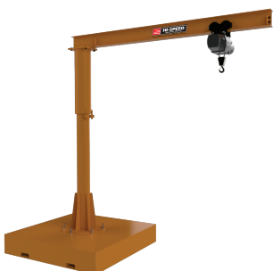
Model 350PJ Portable Light Duty Jib Crane Freestanding & Portable Capacities up to 1/2 Ton Spans up to 16 Ft. Heights up to 16 Ft. Parking Device Included 360 rotation Pre-Filled or Hollow Base