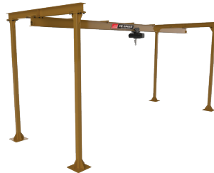
Model MN & RW Freestanding Monorail & Runway Structures Freestanding or Ceiling Hung Fully Customizable Straight or Curved I-Beam or Enclosed Track Capacities up to 10+ Ton Custom Runway Systems for Underhung or Top Running Cranes