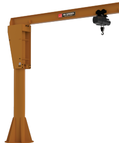
Model 351 Freestanding Heavy Duty Jib Crane Heavy Workload Capacities up to 20 Ton Spans up to 35+ Ft. Heights up to 35+ Ft. 360 Rotation Foundationless Mounts Available Motorization Available