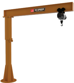
Model 350 Freestanding Light Duty Jib Crane Economical Solution Capacities up to 1 Ton Spans up to 16 Ft. Heights up to 16 Ft. Simple Installation 360 Rotation Foundationless Mounts Available Epoxy Anchor Kits Available