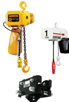
Hoists & Trolleys Manual, Electric, Air, Chain & Wire Rope Options Chain & Wire Rope Electric & Air Powered Single Speed or VFD Manual Chain and Lever Hoists Ergonomic Lift Solutions