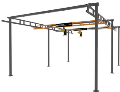
Model WS Freestanding Enclosed Track Workstation Cranes Capacities up to 2 Ton Span Lengths up to 34 Ft. Manual or Motorized Low Headroom Solutions Freestanding or Ceiling Hung Fully Customizable