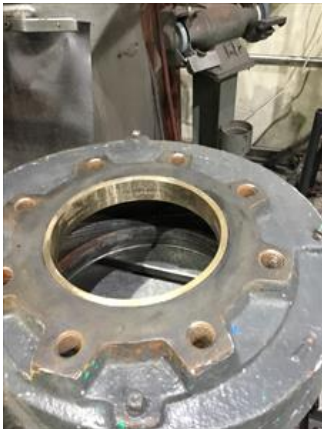
Installed new bowl wear ring. Finish I.D. 6.079 Gary