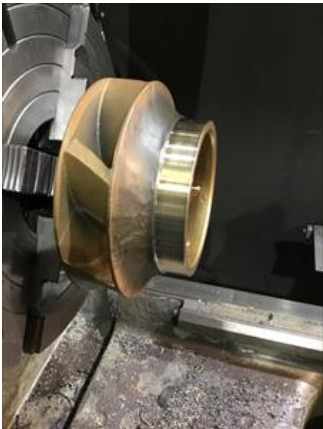
Resurfaced impeller seat. Finish dia. 6.060" Gary