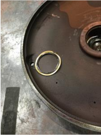
40. Opposite Drive End Bearing Condition