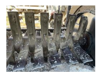
More places where rotor was hitting screen. New screens were installed after balance job.