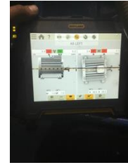
new holes before weld