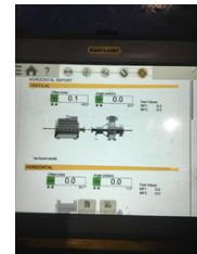
New hole after weld