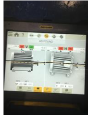
new holes after weld