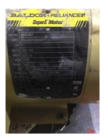
3. Photos of all six sides of the machine.