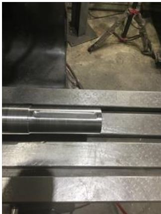
Welded and remachined drive diameter and keyway.