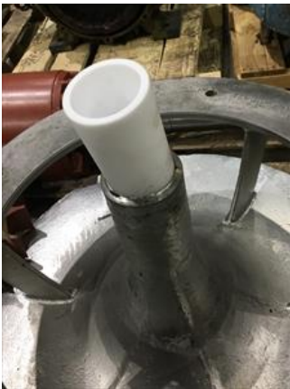
Machined new bushing.