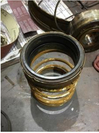
12. Seal Material on Stationary Seat