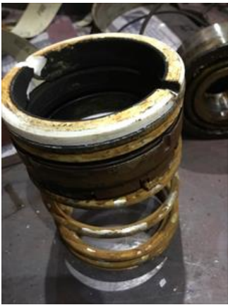
13. Mechanical Seal ID/Shaft Diameter